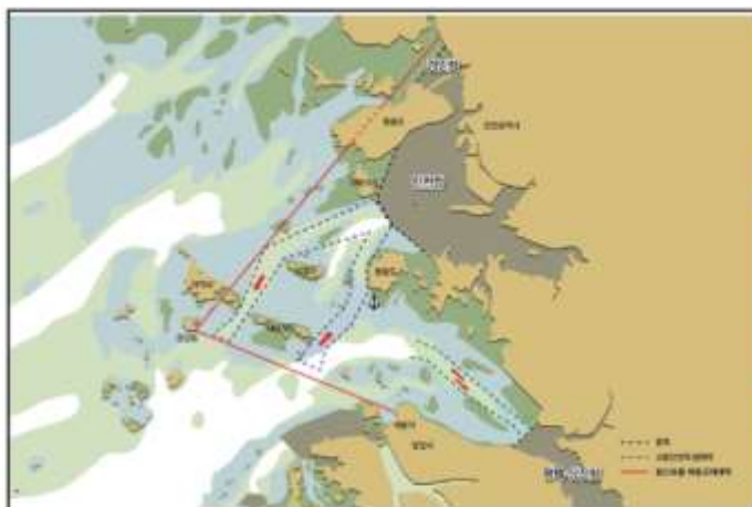
Incheon and Pyeongtaek-Dangjin