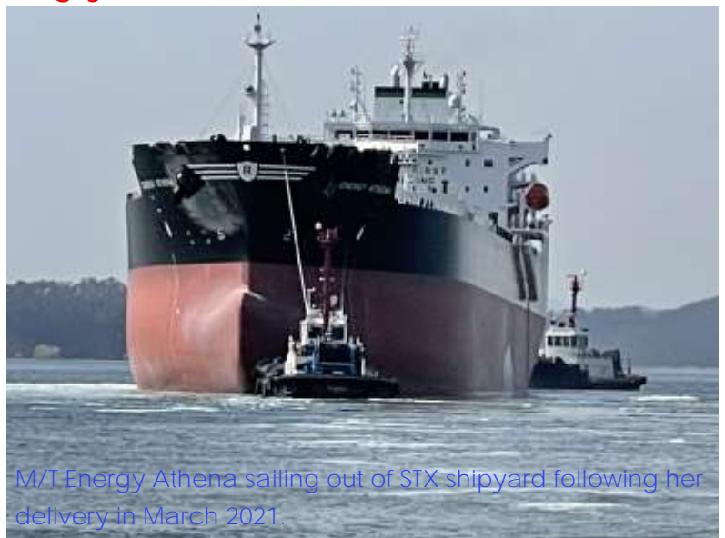
M/T Energy Athena sailing out of STX shipyard following her delivery in March 2021.